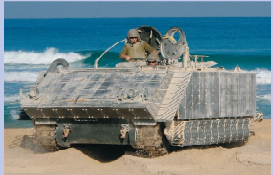
Armoured Personnel Carrier (APC) Highly Protected With Enhanced Performances