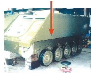
Improved Suspension System