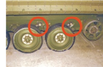
Additional Shock Absorbers