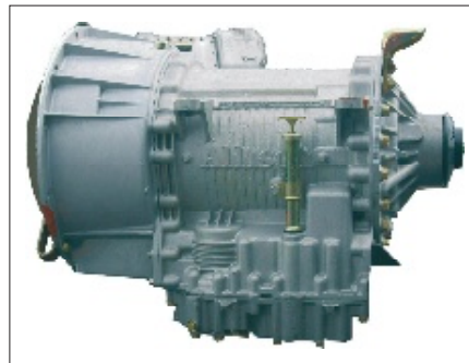
Fully Automatic New Commercial Allison Transmission

Allison's 3000 series automatic transmission is fully electronic