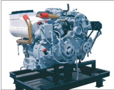
The M-113 N-2000 New Powerpack