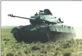
Nimda Powerpack with Allison Transmission, complete upgrade & modernization program