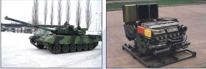
Nimda modern Powerpack for T-72 Tank