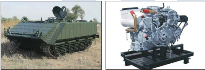
Nimda Powerpack with Allison Transmission, complete upgrade & modernization program